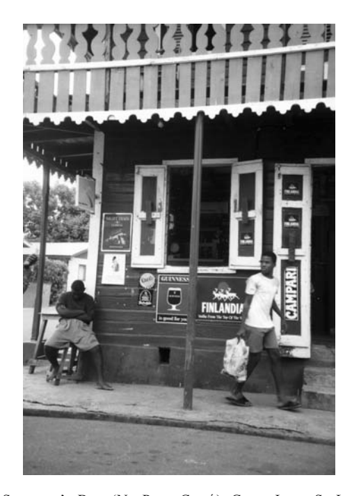
11. SCOTTIE'S BAR (NO PAIN CAFÉ), GROS-ILET, ST LUCIA