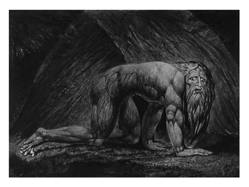
7. WILLIAM BLAKE, "NEBUCHADNEZZAR" (PRINT, PEN AND WATERCOLOUR, 1795)

ground, which in "Newton" had glowed with a mysterious aura, now encloses the creeping form in a sombrely two-dimensional cave composed of the elements of lines and arcs in Newton's drawing.