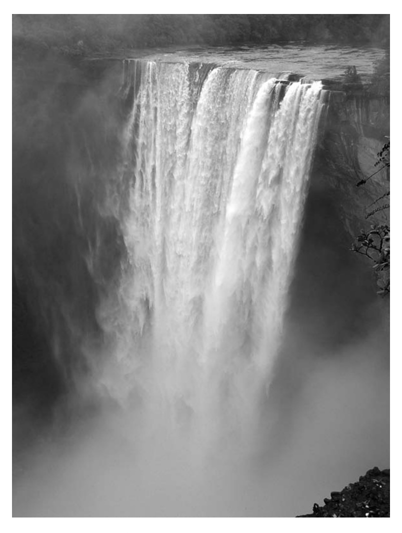
13. KAIETEUR FALLS, GUYANA