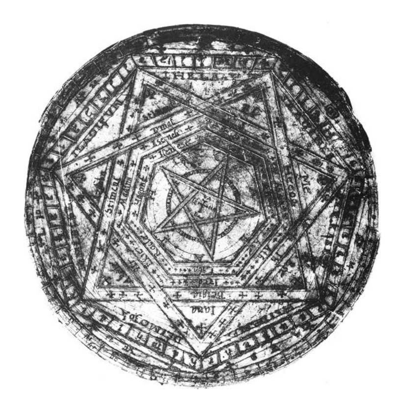
3. John Dee's Seal of Aemeth, for summoning angels

both magic and conventional religious practice. <sup>15</sup> The circle, often completed with a square and triangle, or pentagrams symbolic of the proportions of a human being as the Anthropos and image of God, was a feature of conjurations described by Scot or Agrippa, derived from the grimoires, or of the ceremonial table used by Dee for 'scrying' (fig. 3). According to the Clavicula Salomonis or Agrippa's Fourth Book of Occult Philosophy , the circle afforded protection from the power of the spirits which might be called up; in other words it afforded a symbolic space for consciousness which was not immediately immersed in the elements of the unconscious, as might happen in dreams or in madness.