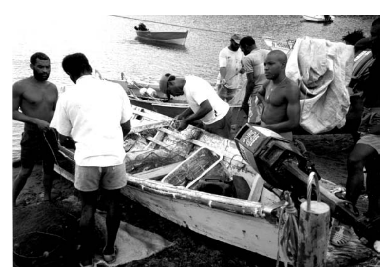
12. FISHERMEN WITH PIROGUES, SOUFRIÈRE, ST LUCIA