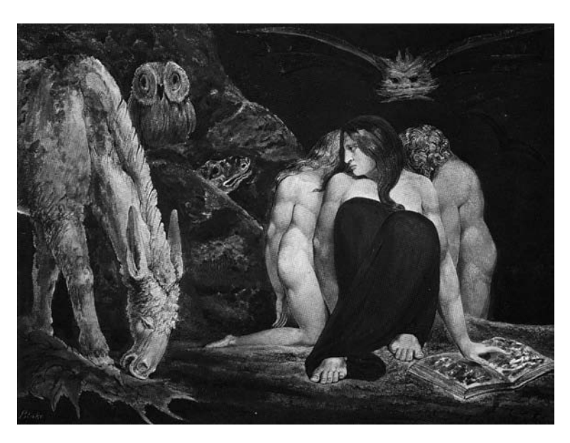
10. WILLIAM BLAKE, "HECATE" (PRINT, INK AND WATERCOLOUR, C.1795)