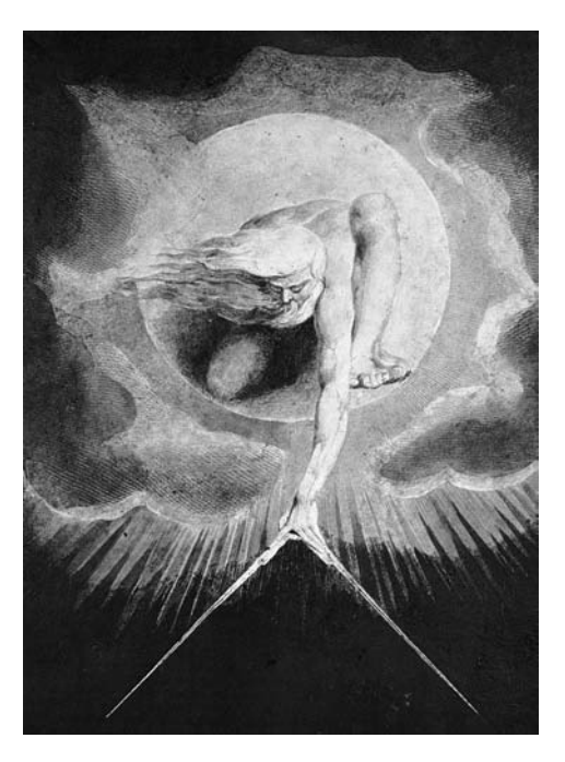
6. WILLIAM BLAKE, "THE ANCIENT OF DAYS" (RELIEF ETCHING WITH WATERCOLOR, 1794) COURTESY LIBRARY OF CONGRESS

The figure of "The Ancient of Days," seen from the side, closely resembles the figure of Newton in one of Blake's most famous prints, dating from 1795: